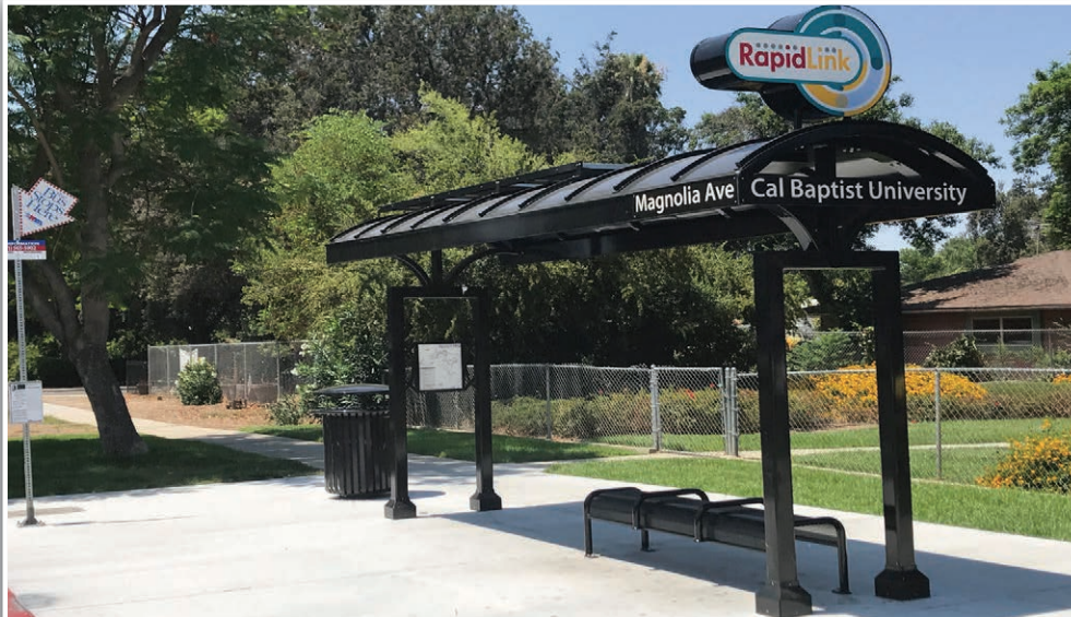
Tolar Manufacturing Company fabricated Bus Rapid Transit shelters to support Riverside Transit Agency's new RapidLink express buses between Riverside and Corona.

THE PERFECT FIT TO REFLECT THE CHARACTER OF YOUR COMMUNITY